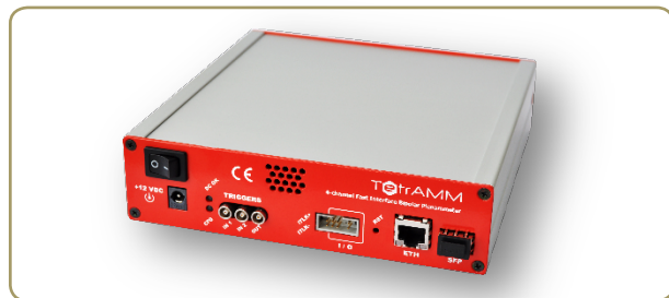
TetrAMM – Rear View